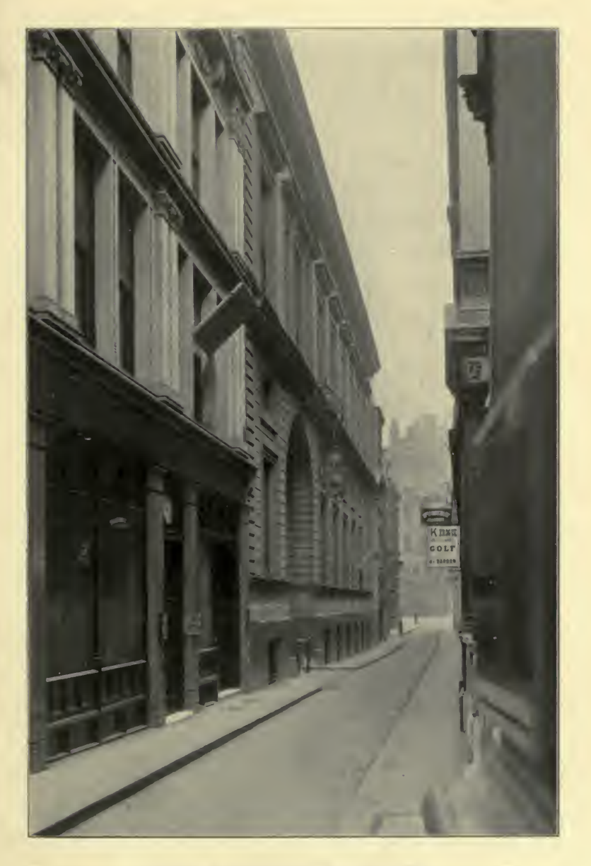
THE ROTHSCHILD OFFICES, St. Swithin's Lane, London, E.C. (House on the left with ornamental hanging sign.)