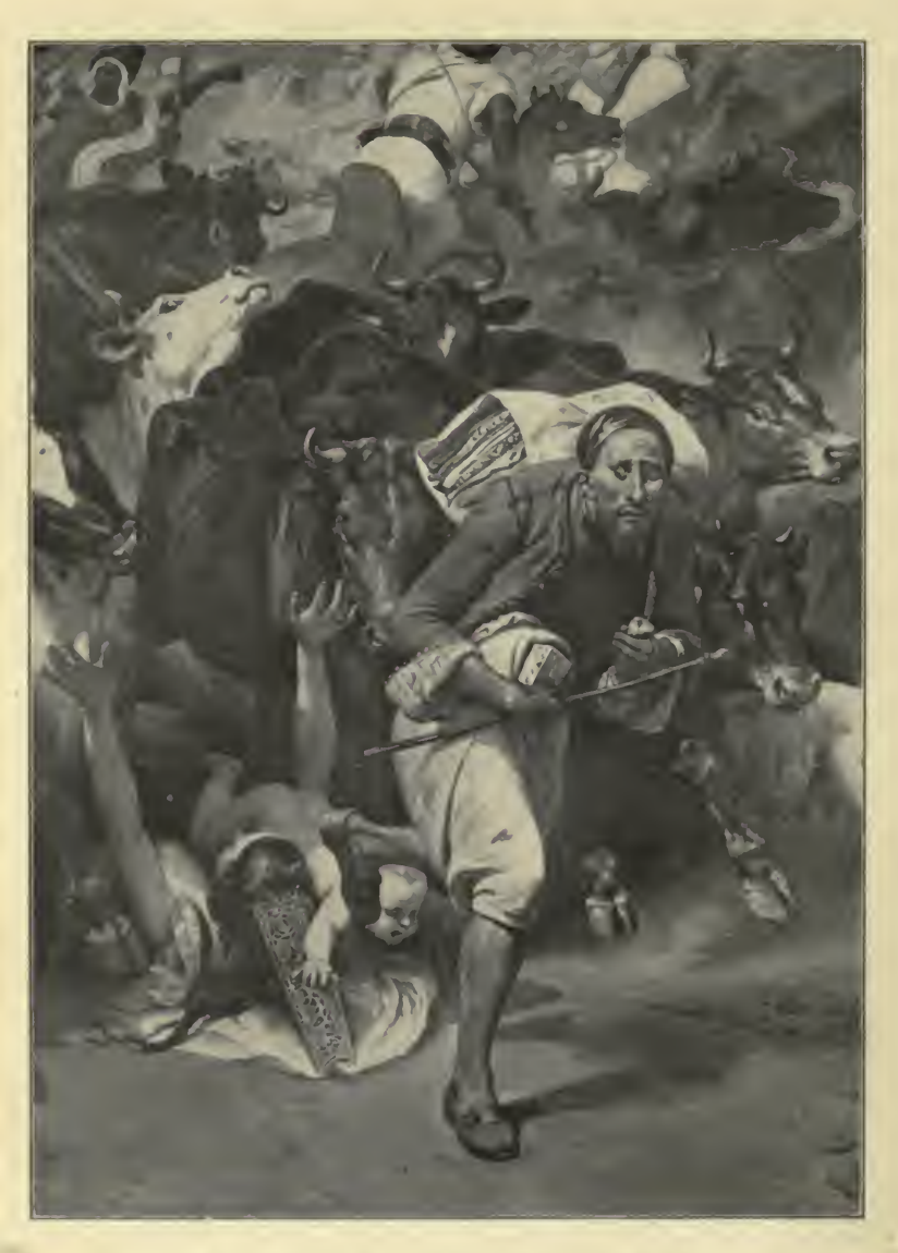
FIGURE OF TERRIFIED JEW IN VERNET'S FAMOUS PICTURE.